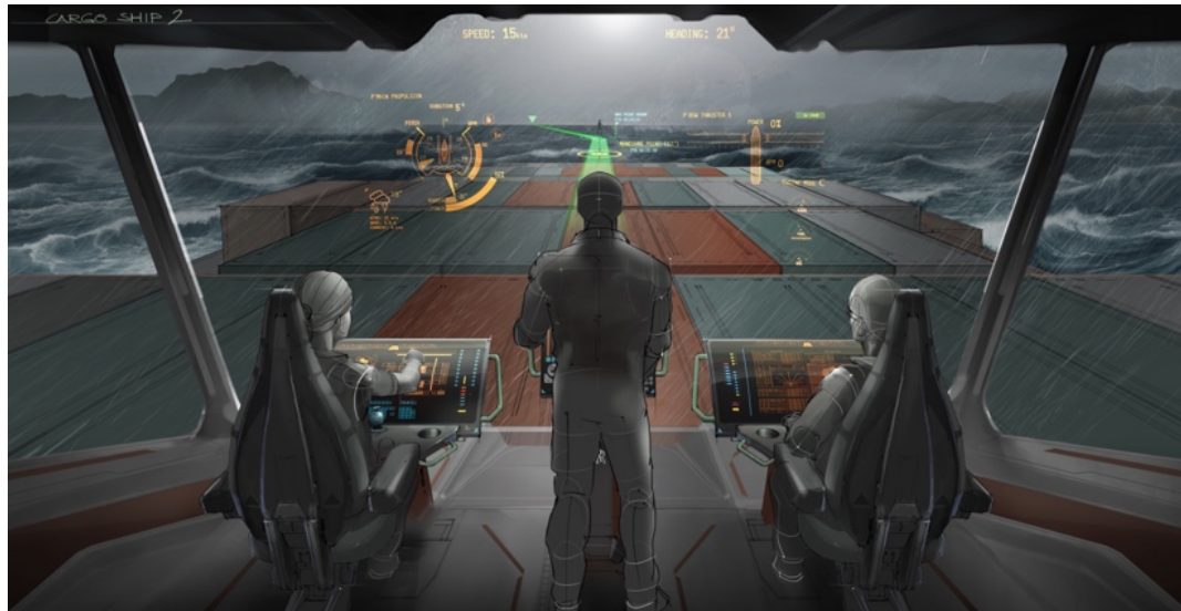
Figure 2. Notional Heads-up Display

particular display technology is variously described/defined as: Maritime Augmented Reality or Head-mounted Display Optical Pass Through. 54